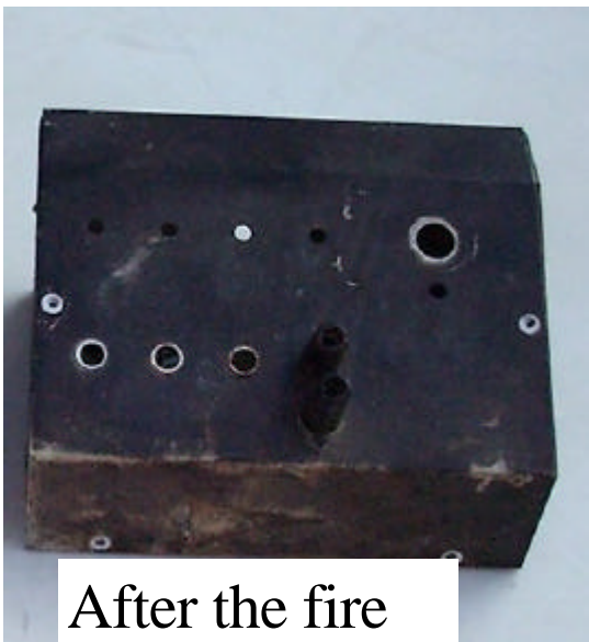
After the fire